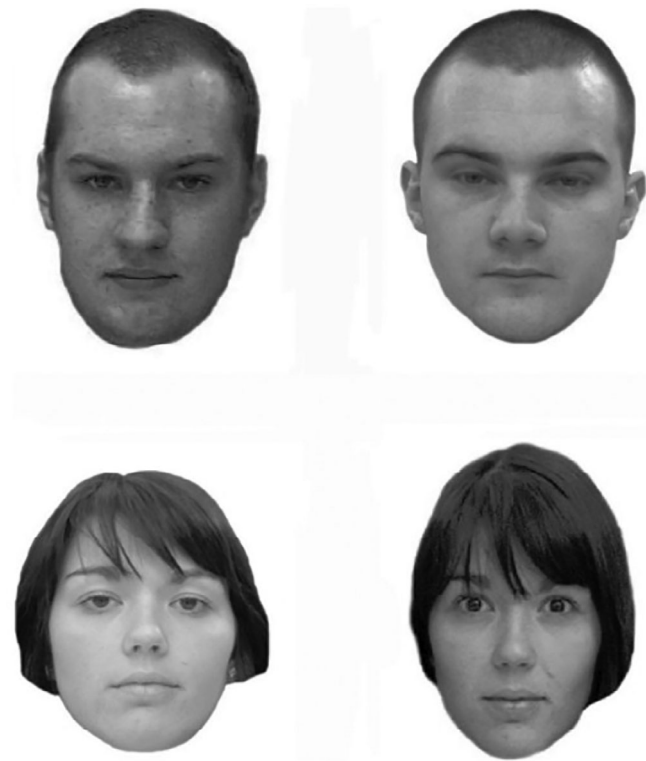
FIGURE 1 Example face pairs from the GFMT. A mismatch pair (top row) and a match pair (bottom row)

(b) think they are the same; (c) do not know; (d) think they are not the same; (e) sure they are not the same. Trial order was randomised for each participant, no time limits were imposed upon responses, and no feedback was given at any stage.